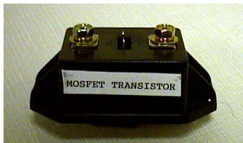
MOSFET MODULE POWER SEMICONDUCTOR DISSIPATION RATE $ 1 W 8541.29.00 HQ 084659