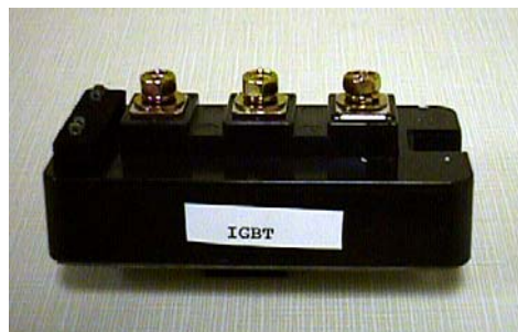
INSULATED GATE BIPOLAR TRANSISTOR MODULE (IGBT) DISSIPATION RATE $ 1 W 8541.29.00 HQ 084659